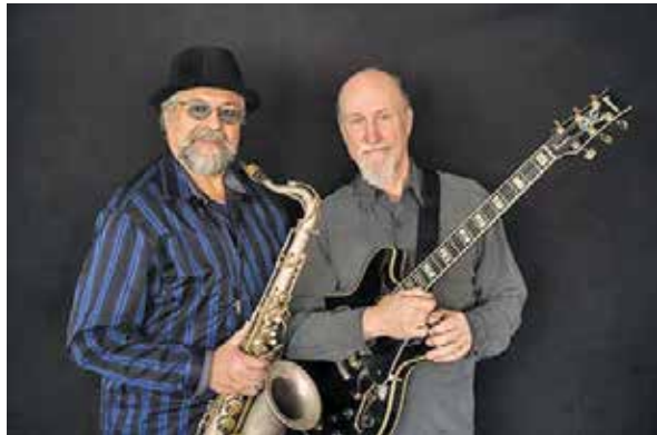
John Scofield and Joe Lovano