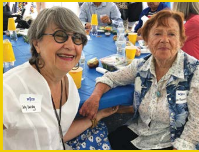
WJCS celebrated Holocaust Survivor Day , in partnership with UJA-Federation of NY and with sponsorship from the Claims Conference, at a luncheon that saluted the strength and resilience of Holocaust survivors in our programs.