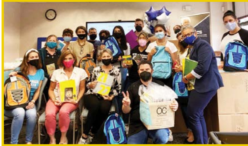
Our 2021 WJCS Back-to-School Drive was a huge success, thanks to support from Supplies for Success, UJA in Westchester, Mastercard, Order Out of Chaos, and dozens of generous donors and community organizations. WJCS distributed 300+ backpacks, filled with new school supplies, to children in under-resourced communities.