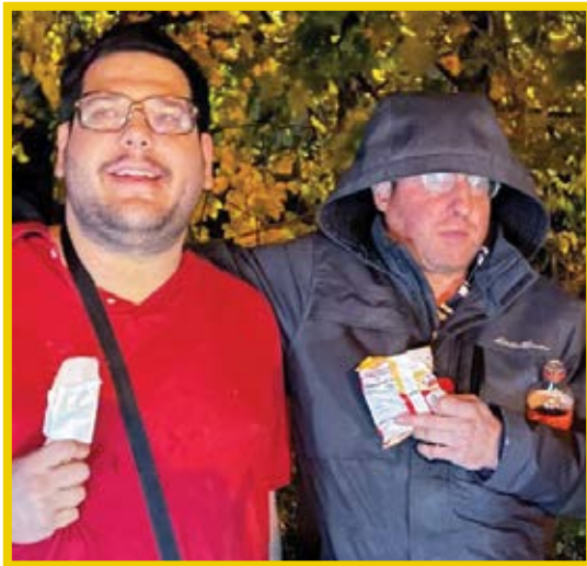
Participants in Shelanu, a membership community for young adults with autism , were full of gratitude as they enjoyed a Thanksgiving celebration in our backyard at headquarters.