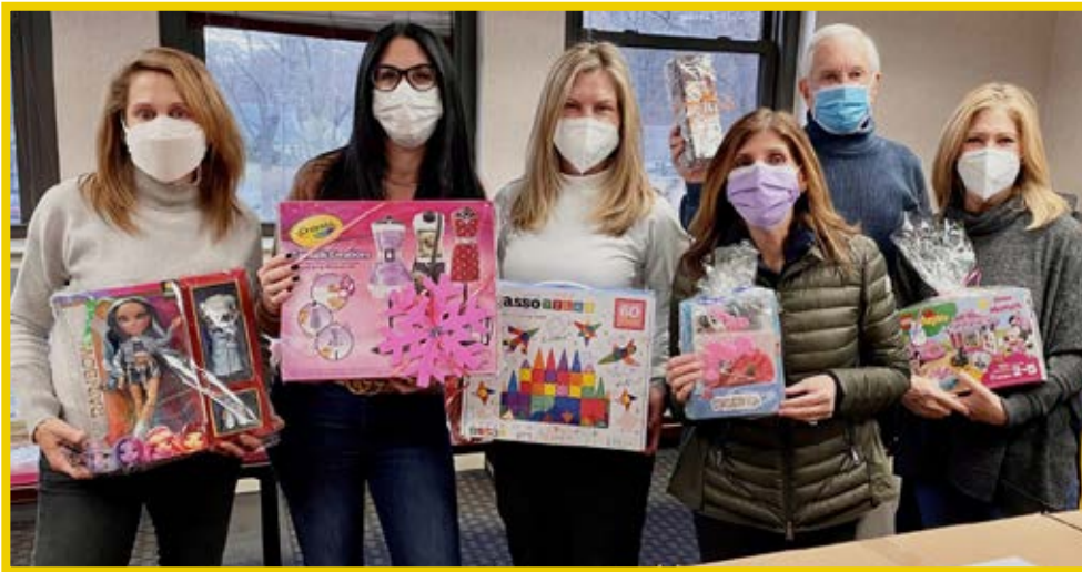
WJCS Board members and volunteers from UJA in Westchester donated and organized hundreds of new toys to ensure that our WJCS Have a Heart for the Holidays Gift Drive brought joy to children in need throughout Westchester.