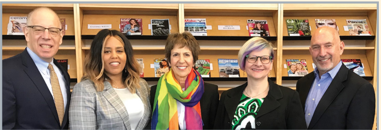
WJCS Center Lane, the only center for LGBTQ youth in Westchester, won a Public Health Honoree Award from the Westchester County Board of Health.